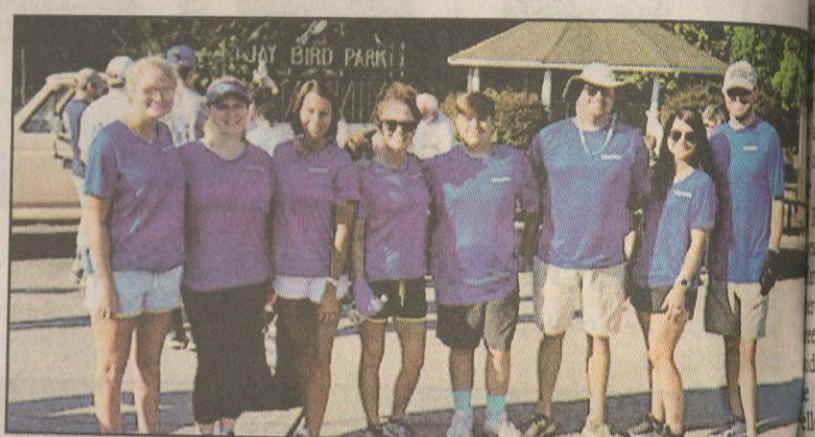
Team Iuka Discount Drugs helping make a difference!