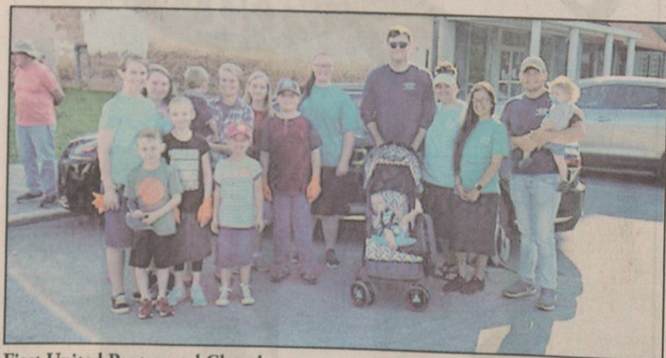
First United Pentecostal Church group